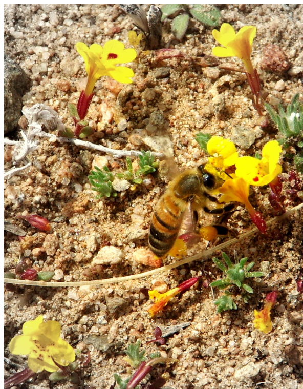
Erythranthe carsonensis and Apis mellifera on Prison Hill in Carson City, April 19, 2017.

Bring lunch, hiking gear, appropriate clothing, wide brimmed hat, sunscreen, insect repellent, plenty of water and don't forget your hand lens and camera.